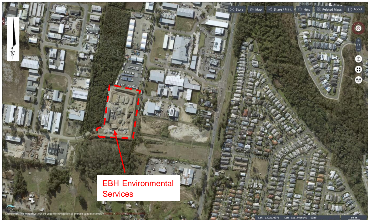
Figure 1 – Site Locality

EBH Environmental Services (EBH) facility is located at 60 Donaldson Street, Wyong (refer Figure 1).